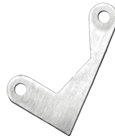
4600AR-C Jagg anti-rotation device