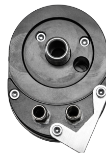
T-C Touring & Dyna fitment