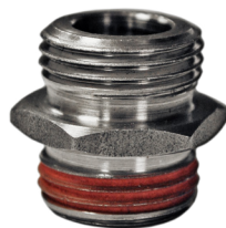
Stock-to-Jagg oil filter nipple

Install by inserting the orange-painted end into the port where the stock oil filter stem was removed. Using a 7/8" socket, tighten until the hex is flush against the oil filter housing.