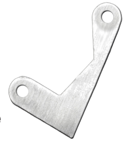
4600AR-C Jagg anti-rotation device